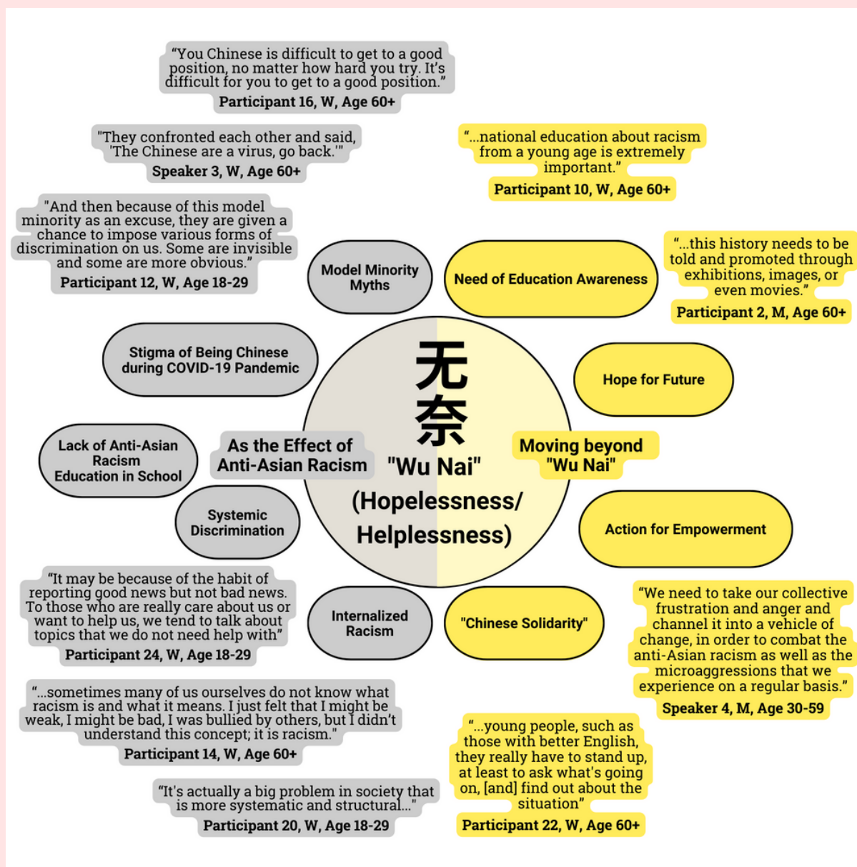
Figure 3: “Wu Nai” as the Effect of Anti-Asian Racism & Moving Beyond “Wu Nai”